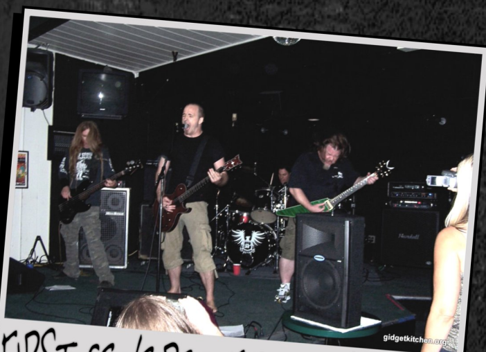
FIRST SEVERED FIFTH LIVE SHOW!